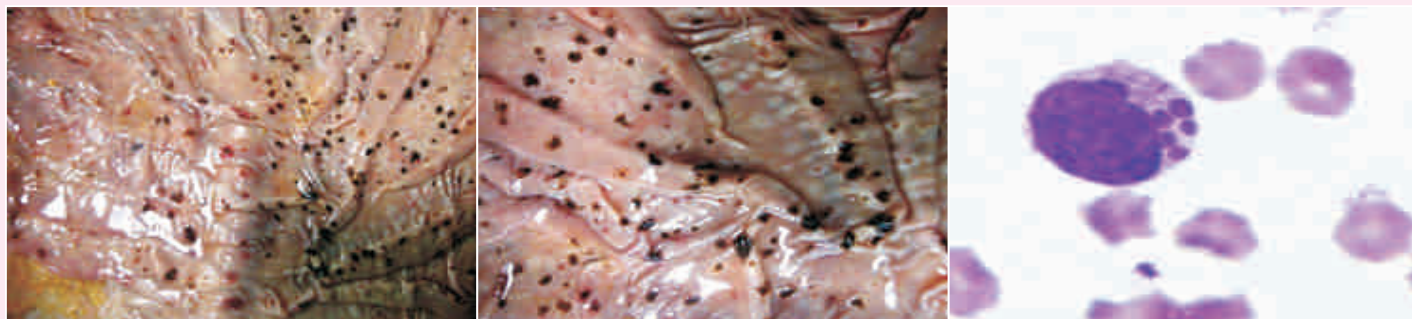
Fig.1: Abomasum showing several punched out ulcers surrounded by haemorrhagic zone.

One year old, male cross-bred bovine bull calf from Division of Biological Standardization of this institute was presented to Post Mortem Facility of Division of Pathology, ICAR-IVRI, Izatnagar for conducting post-mortem examination and disease diagnosis. Carcass was emaciated and heavy tick infestation was noticed on external body surface. Conjunctiva was anaemic and gelatinization of subcutaneous fat was observed. Highly enlarged, oedematous and congested pre scapular lymph nodes were seen. Thoracic cavity was filled with approximately 500 ml straw coloured yellowish fluid. Lungs were markedly congested, emphysematous and oedematous and showed focal ecchymotic haemorrhages. Hydro pericardium and petechial haemorrhages were observed on epicardium and endocardium. Spleen was enlarged, oedematous and congested. Liver showed focal greyish white patches and markedly distended gall bladder. Gelatinization of perirenal fat and congested medulla of kidney was observed. Typical numerous punched out ulcers were seen on the abomasal mucosa surrounded by haemorrhagic zone (Fig.1). Small intestine showed acute catarrhal enteritis and mesenteric lymph nodes were enlarged and oedematous. Caecum showed numerous punched out ulcers surrounded by haemorrhagic zone (Fig. 2). Markedly congested meningeal blood vessels were also observed. Impression smear from lymph node stained with Giemsa method showed presence of typical Koch's blue bodies (schizonts) in the cytoplasm of lymphocytes (Fig. 3).