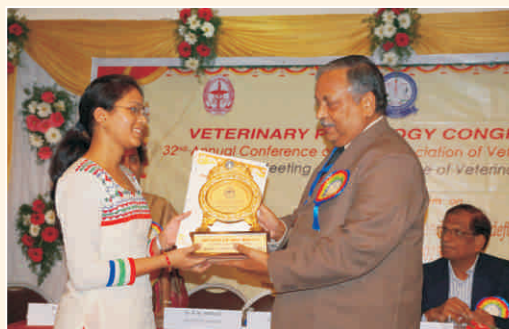
IAVP Award to Young Pathologist