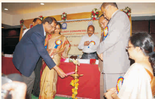
Lighting of lamp by Vice Chancellor