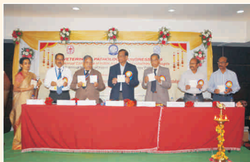
Release of CD of Compendium