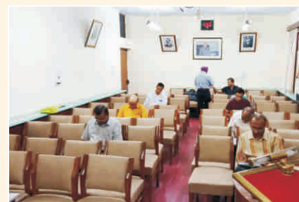
ICVP Board Certification Examination