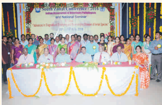
A group photo of SZ IAVP Conference, Tirupati