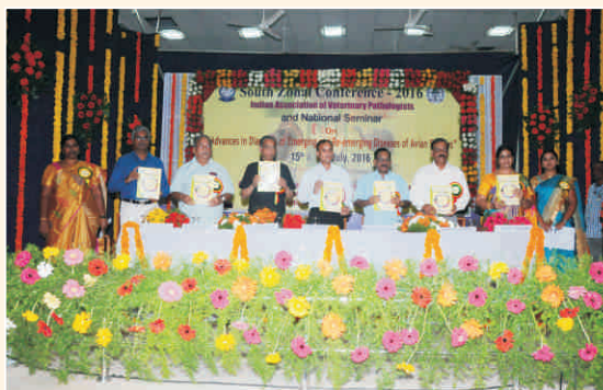
Release of Conference Compendium