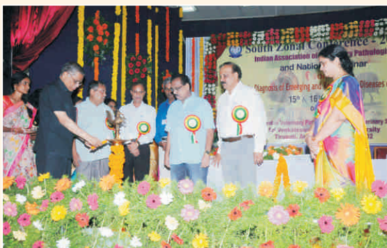
Lighting of lamp by dignitaries