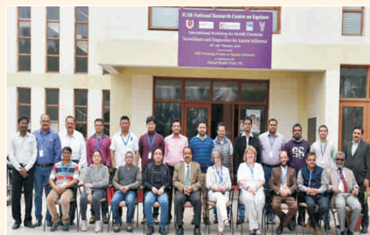
A Group Photo of Participants and Trainers