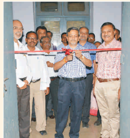
Opening of Study Centre at Nagpur